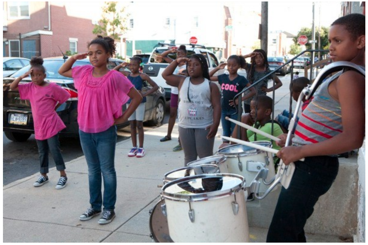
Figure 5. The Unique Miracles drill team practices on a Mantua sidewalk

My kids practice all winter in the cold because no one gave us a building. I don't get any funding. My house is literally falling down ... but we are still trying to save our youth ... if the money's not there, what do we do? — focus group participant, leader of a youth drill team and drumline.