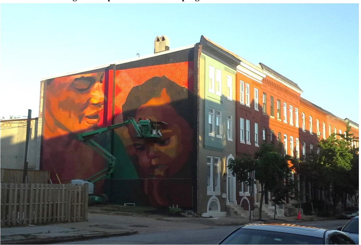
Figure 3. Open Walls mural in progress in Greenmount West

discontinue subsidizing working artists through grant programs and public–private workshop and housing developments, they risk a future where the connection to the arts is purely symbolic.