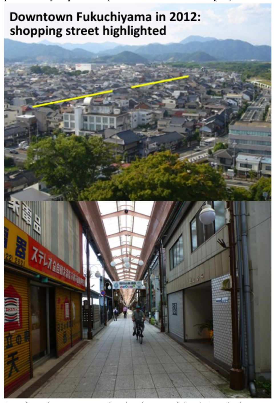
Figure 1. An aerial view of Fukuchiyama, a city of 78,000 inhabitants situated in the northern part of the Kyoto prefecture (about 20 miles/30 km from Kyoto)

Seen from above, we cannot imagine that one of the city's main downtown commercial arteries is hollowed out.